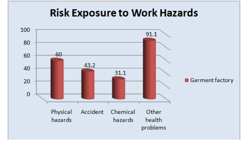
Figure (2): Frequency distribution of child complaint from health problems related work